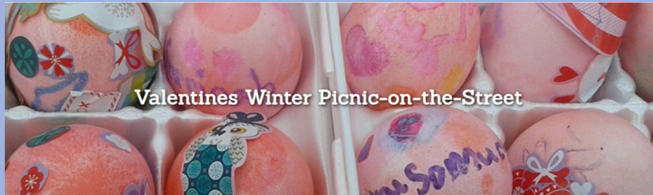
Valentines Winter Picnic-on-the-Street

www.standrewskentct.org * 860.927.3486 * st.andrew.kent@snet.net